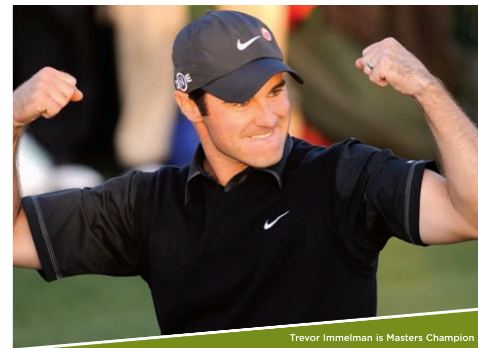
Trevor Immelman is Masters Champion

Four months after he had a tumor removed from his back and inspired by a voice mail from a legend, Trevor Immelman withstood the swirling winds and Sunday pressure of Augusta National to win The Masters. He became the first South African in a green jacket in 30 years, following his boyhood idol, Gary Player.