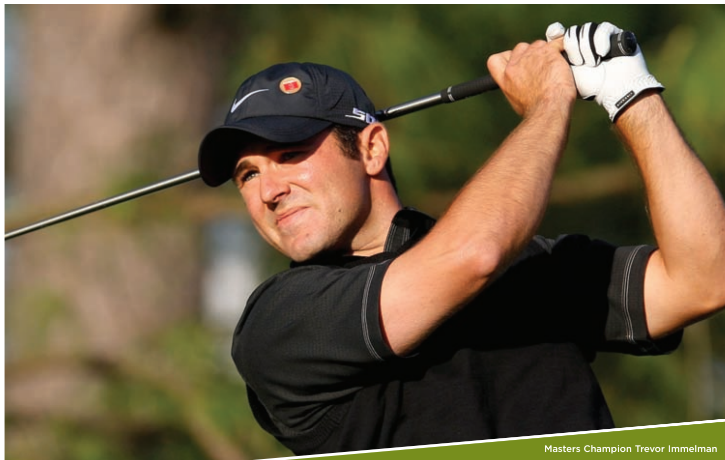
Masters Champion Trevor Immelman