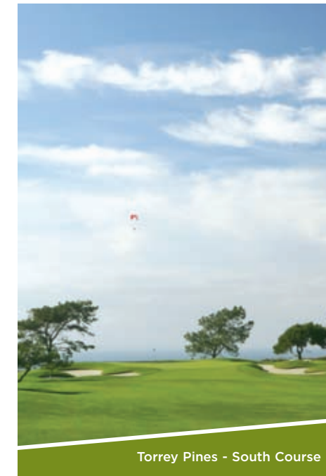
Torrey Pines - South Course

Jones also added 38 bunkers, though he left plenty of room off the tee, and he fiddled with green contours and location, moving several greens closer to canyon edges. The effect of the changes can be seen in the winning scores at the Buick Invitational: in the three years prior to the renovation, the average winning total was 268; in the seven years since, including Woods' runaway victory in January, the average winning score was nearly 274.