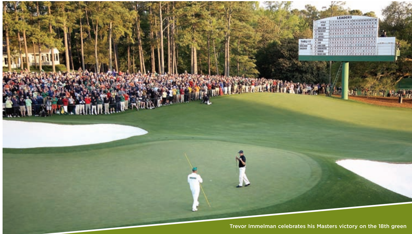
Trevor Immelman celebrates his Masters victory on the 18th green